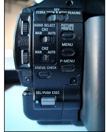
AUDIO SELECT = AUTO