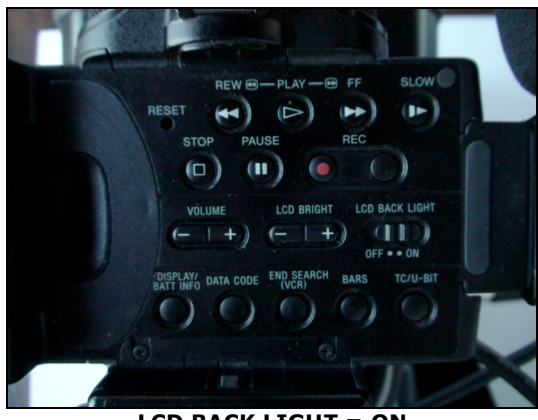
LCD BACK LIGHT = ON