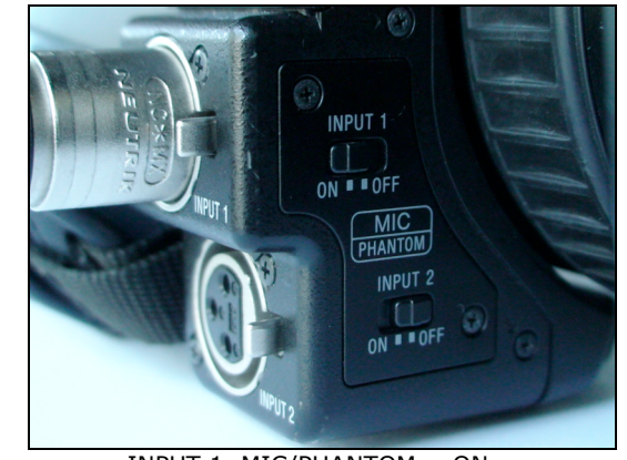
INPUT 1, MIC/PHANTOM = ON