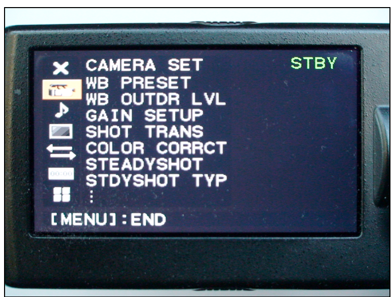
What you will see on MENU select

6) At the back of the camera, push the "MENU" button. On the left side of the LCD display, you will see a set of menu icons, which are "CAMERA SET", "AUDIO SET", "LCD/VF SET", "IN/OUT REC", "TC/UB SET" and "OTHERS".