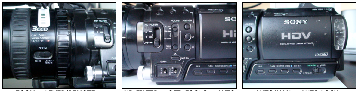
ZOOM = LEVER/REMOTE