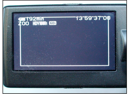
Battery life in minutes, time of day time code, zoom amount, video format (HDV1080i) and 4:3 Marker

TMZ CONFIDENTIAL INFORMATION DO NOT COPY OR DISTRIBUTE WITHOUT TMZ CONSENT